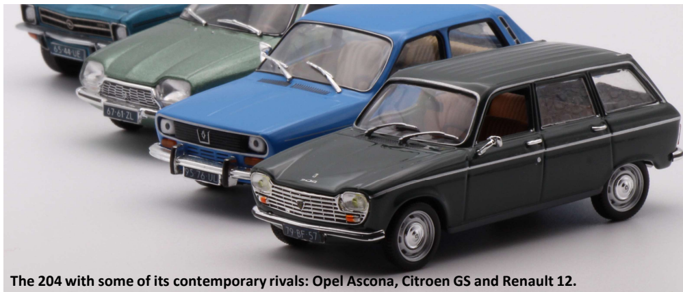
The 204 with some of its contemporary rivals: Opel Ascona, Citroen GS and Renault 12.

The 204 changed very little over the course of its production run. This Norev model car is a 1974 Break in a chic dark shade of green called "Antique Green" that combines very well with the brown interior. I personally like the very simple steel wheels and the expansive chrome grille that covers most of the frontal area and surrounds the headlamps and indicators neatly. The concave bonnet line in combination with squared-off headlamps as first seen on this 204 would become a hallmark feature of Peugeot design for many years. On cars such as the 304, 504 and 505 it seemed to convey a subtle angry look; given the expansive chrome grille the effect on the 204 is the opposite, as it seems to have a fairly friendly face.