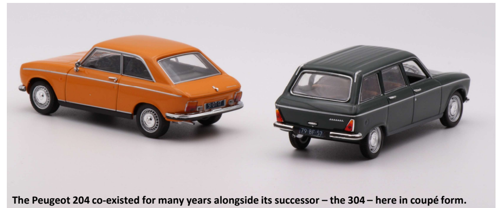
The Peugeot 204 co-existed for many years alongside its successor – the 304 – here in coupé form.