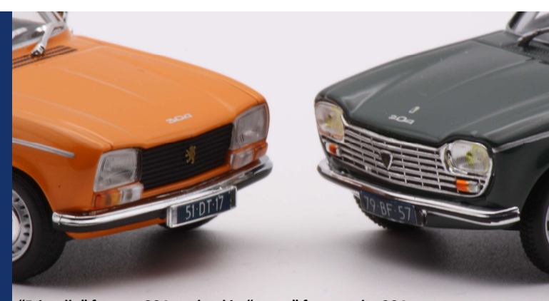
"Friendly" face on 204 evolved in "angry" face on the 304.

The French back catalogue of charming cars is quite extensive, but in my view the 204 should definitely feature high on the list of French automotive triumphs. Perhaps not as iconic as a Renault 4 or Citroen Ami, yet the 204 epitomizes what French charm in a car is all about: basic but forward-thinking engineering, simple but gracious exterior design, and a utilitarian purity that comes out best in the long-lived yet worn-out 204s that graced the streets of French countryside villages until well in the 1990s.