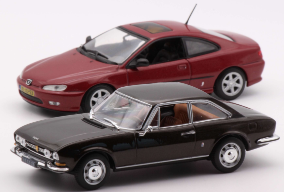
The 504 Coupé was an important inspiration for the 1990s 406 Coupé.

Peugeot has made various beautiful cars, but none will trump the 504 Coupé for sheer beauty. Many will even consider it among the most beautiful coupés of all time. Certainly, Pininfarina did a stellar job in designing a coupé derivative on the 504 platform. Apart from the distinctive downward curving bonnet line that resembles the 504 saloon, the 504 is a clean-sheet design. The long-nose and cab-rearward setup give the car stunning proportions that revoke the Alfa Romeo 105/115 series Giulia-based coupés. The original design, from before the 1974 facelift, has more original – and to my eyes – more beautiful detailing, such as the separated-out rather than joined-up twin headlamps, a chrome rather than black plastic grille, and rear lights made up of quadruple diagonals rather than more conventional rectangular units. I also like the understated steel wheels with hubcaps: a design with the basics spot on needs nothing more!