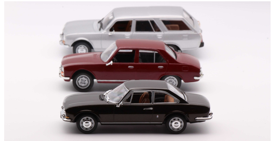
The 504 range included a broad range of body styles including a berline and Break.