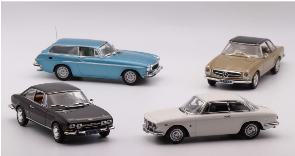
The 504 Coupé is among the most beautiful coupés of the 1960s and 1970s.

This Norev model showcases the 504 in its best light. The dark brown exterior brings out the chrome detailing – including the Pininfarina logo behind the doors – very well and it combines beautifully with the lighter brown interior. Given the relative rarity (only a fraction of 504s are coupés; fewer even convertibles), values as of 2023 are quite reasonable; between 20k and 30k in Euros for vehicles in good to exceptional condition.